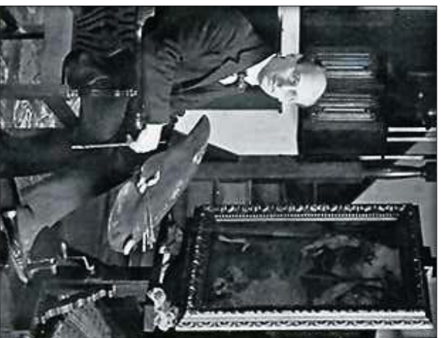
ARTHUR RACKHAM (1867 - 1939)

YOU ARE NOT ALONE IN LOVING ARTHUR RACKHAM